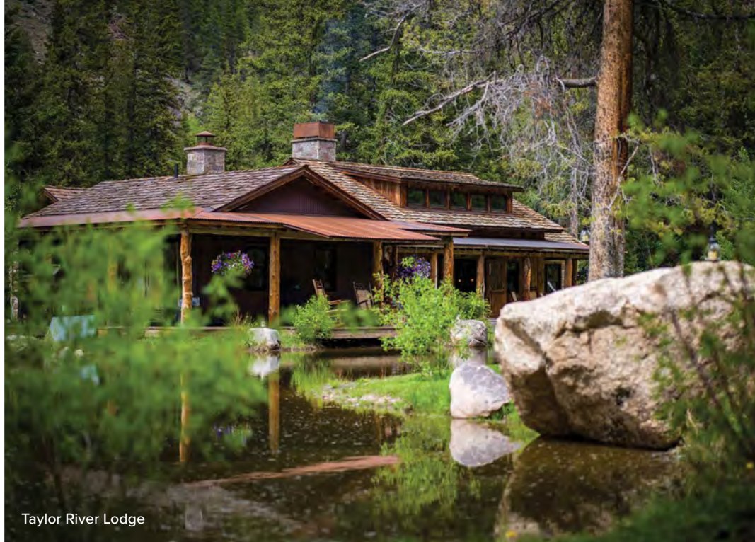
Taylor River Lodge