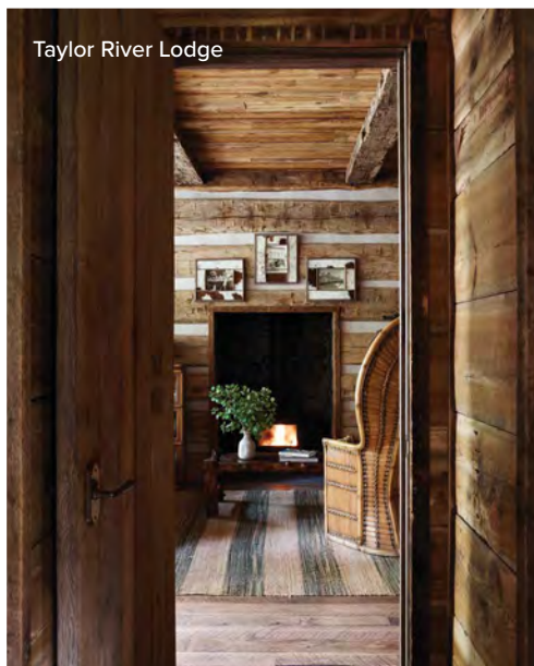
Taylor River Lodge