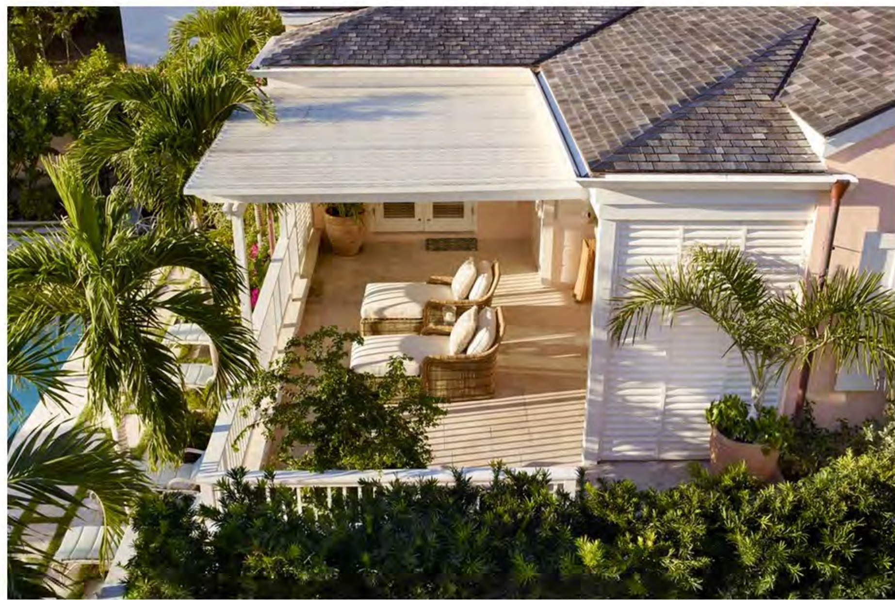
Cottage West terrace at the Bahama House on Harbour Island, Bahamas - Eleven Experience