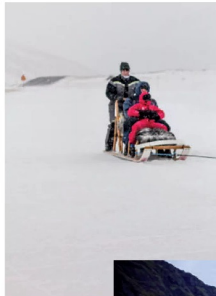
FROM TOP: Eleven Deplar Farm is an off-grid Arctic paradise offering wild adventures

SHOP: FISCHERSUND Musician Jónsi Birgisson from Sigur Rós co-founded this perfume store with his siblings. Blends are inspired by memories and Icelandic moods using local oils and herbs. Poetic descriptions of tarred telephone poles and burnt driftwood are as heady as the scents. fischersund.com